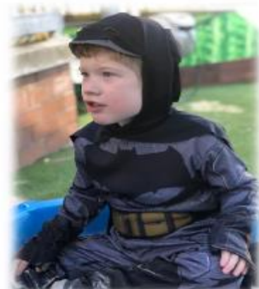
Na na na na na na na na Sonny!