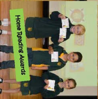
Home Reading Awards