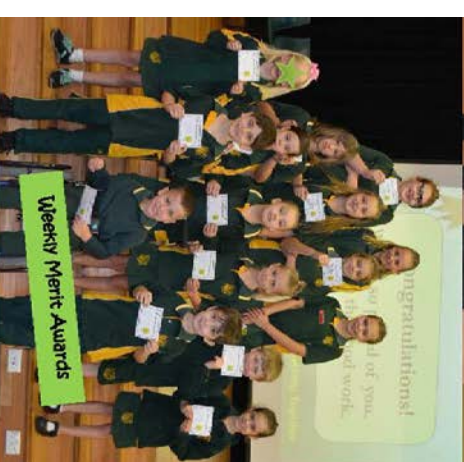
Weekly Merit Awards