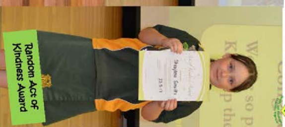
Random Act of Kindness Award