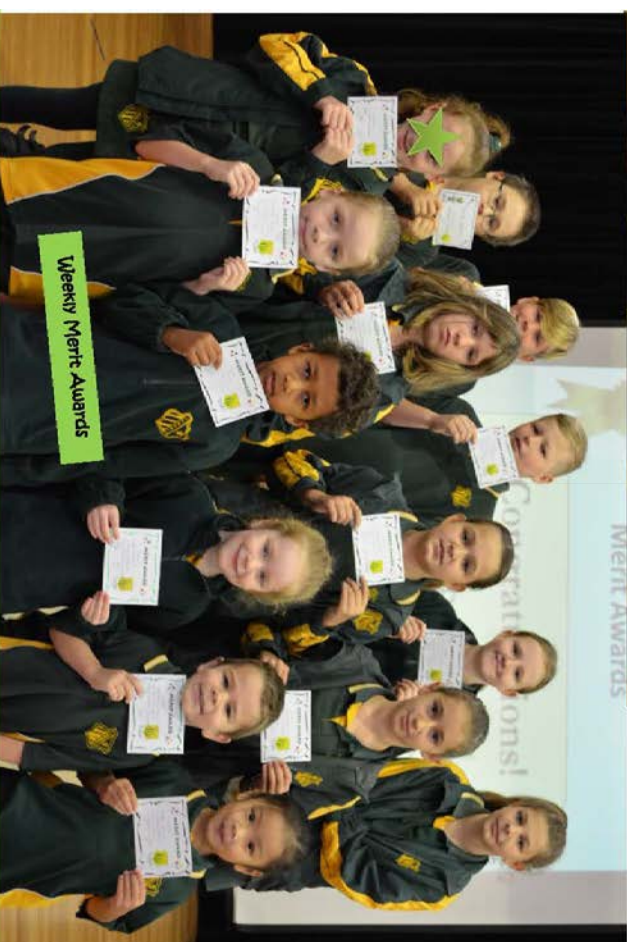
Weekly Merit Awards