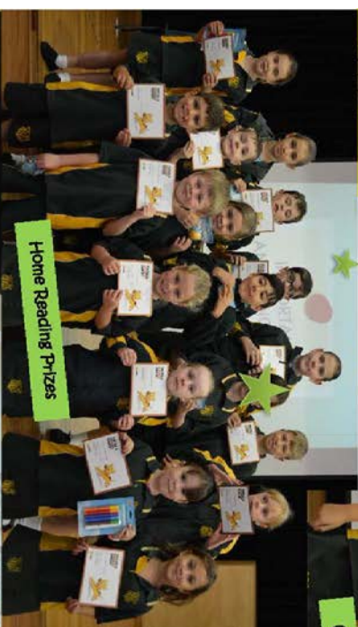
Home Reading Prizes