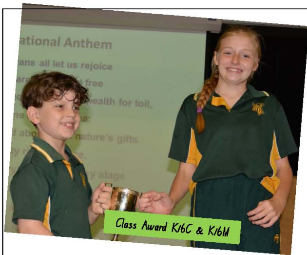
Class Award K16C & K16M