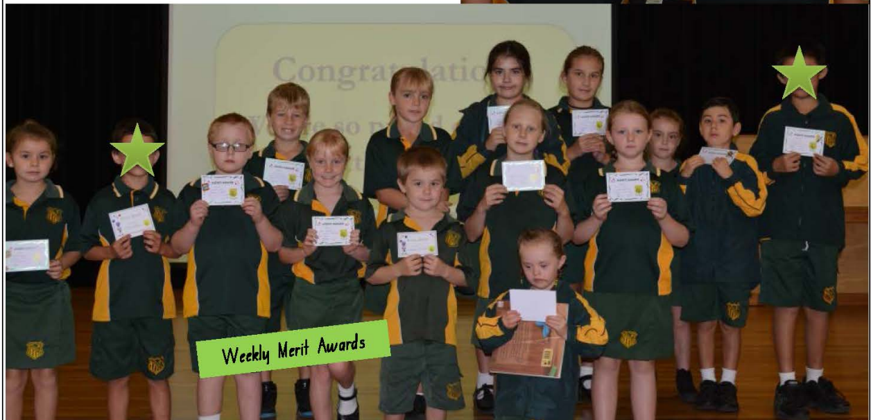
Weekly Merit Awards