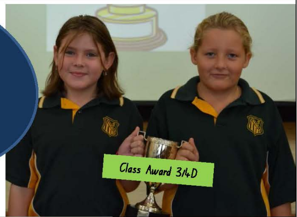
Class Award 3/4D