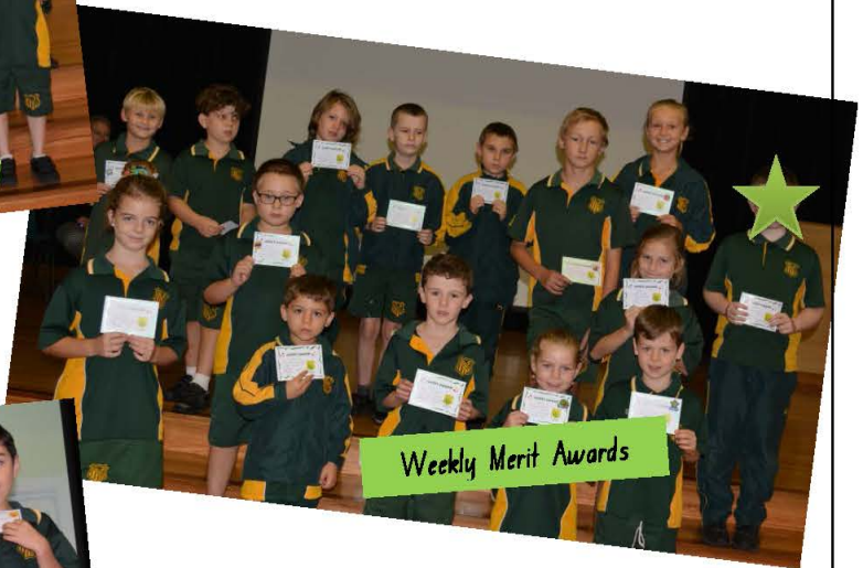
Weekly Merit Awards