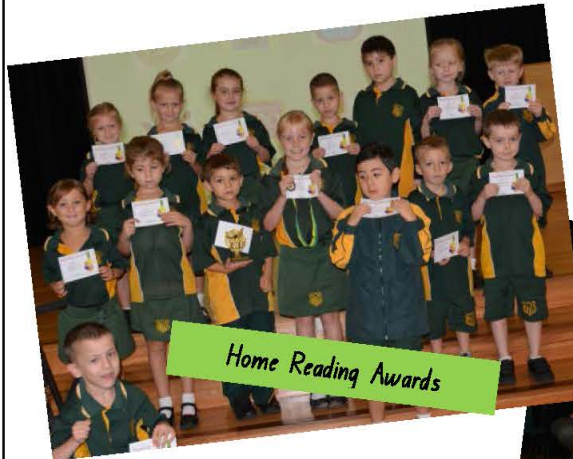
Home Reading Awards